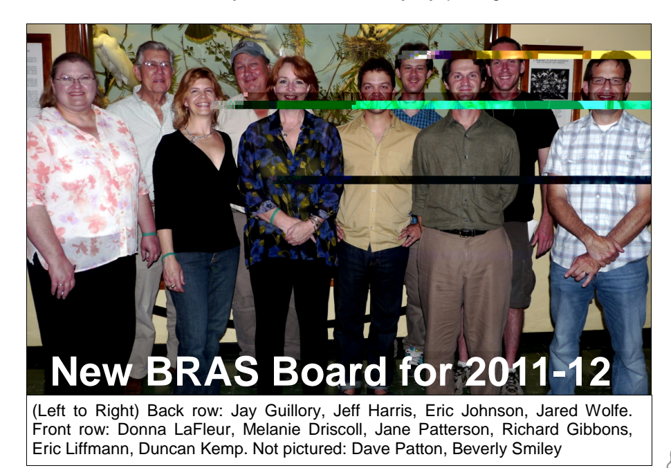
Baton Rouge Audubon Society