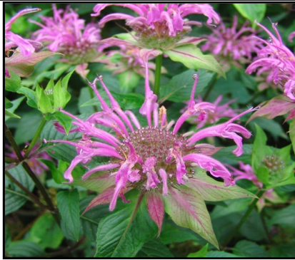
Wild Bergamot Monarda fistulosa

Attention, Pollinators! Dinner is served! -Nine fantastic native plants with nine gardeners' favorite picks-