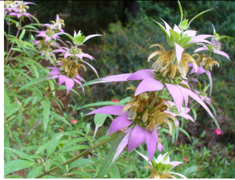
Spotted Bee Balm Monarda punctata