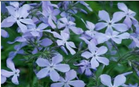
Woodland Phlox Phlox divaricata