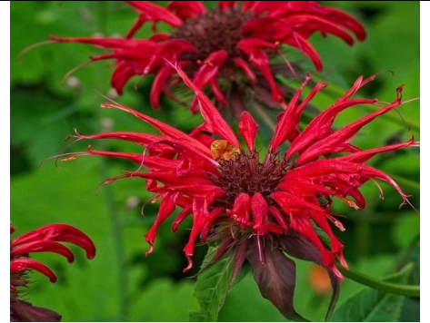
Jacob Cline Bee Balm Monarda didyma