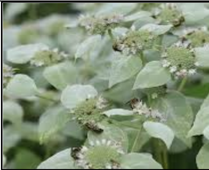
Clustered Mountain Mint Pycnanthemum muticum