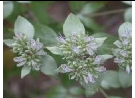
Whiteleaf Mountain Mint Pycnanthemum albescens