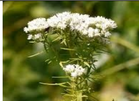
Slender Mountain Mint Pycnanthemum tenuifolium