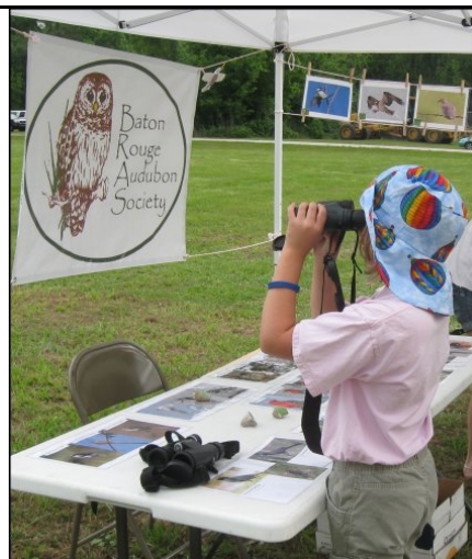
A new bird identification game gave kids and their parents an opportunity to develop their skills at Earth Day and Step Outside Day 2009.