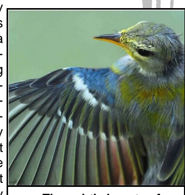
The subtle beauty of a captured Northern Parula

Louisiana Bird Observatory grew from a grass-roots commitment to create a more bird friendly commuthrough promoting quality science, conservation and education. Louisiana Bird Observatory's continued success is similarly dependent on local support and involvement. We invite vou to learn more about Louisiana Bird Observatory by reading the latest 'Audubon in Action' article