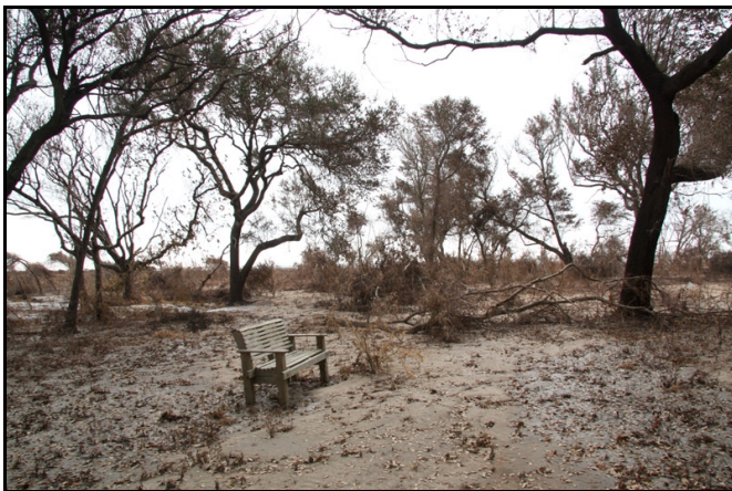
The Leonard East Memorial bench has now survived both Hurricanes Rita and Ike

A clean up day is scheduled for Saturday, November 15th. The main effort will be to remove debris and re-establish walking paths. The water lines seem to be fine and some work may be done on setting up the pond. If you are interested in helping and wish more information, please contact me by phone or e-mail.